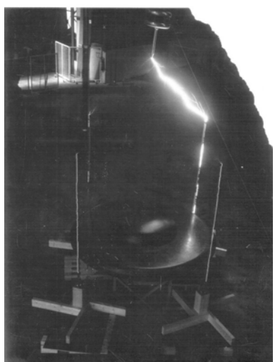
Figure 3 : LEMP tests. We can observe the sparkover along the lightning diverter strips

The 5 MV generator was one more time use for these tests and the current injected in one of the rods was around 5 kA. Values of voltage as high as 840 volts where found on a 10 k \Omega resistance. It was then decided to study a protection scheme based on all the measurements made.