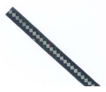
Figure 1 : lightning diverter strip

Near an antenna (radar, radio frequencies ...), set-up of a standard metallic lightning protection system may create troubles due to its metallic frame which may disturb the field emitted or received by the antenna. In most of the cases, this disturbance is negligible if the lightning protection systems is far enough from the antenna. It is not always the case for some radar antennas with narrow angle detection for which the sole presence of the down-conductor (which becomes even more obvious if the conductor is supported by a mast or a pole) brings enough disturbance to prevent the user to install lightning protection means. But experience shows very clearly that lightning impact to radar exists and are creating significant damages. So a solution was needed.