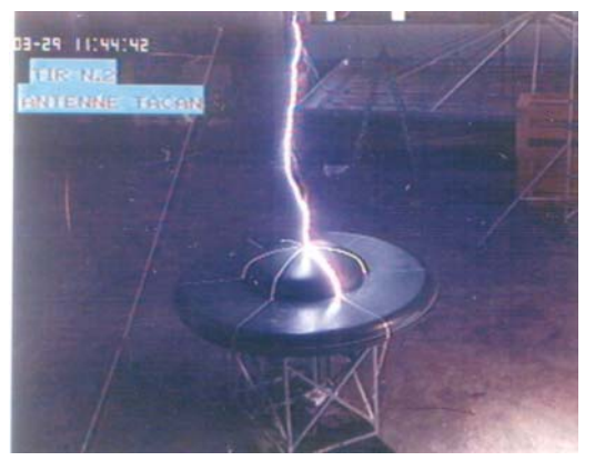
Figure 2 : testing of the strips directly on the radome

A 5 MV Marx generator was used to energized an electrode which was located 2,5 m above the reference plane of the antenna. The radar antenna was a dummy one with equivalent shape and equipped with measuring instruments. For this test, 6 strips where equally positioned on the surface of the antenna like before. Each strips is connected to a down conductor also connected to the frame of the antenna. The position of the electrode was changed in the test in order to find the more sever case. In each test, at least one strip connected the downward leader.